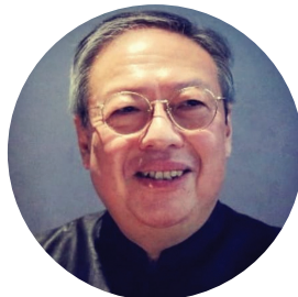
KEYNOTE SPEAKER Prof Ho Chi Ping, Patrick (何志平)