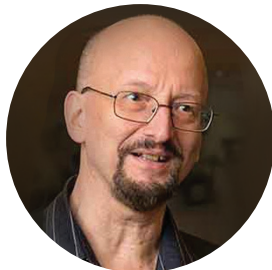
Grand Master Dr Stephen Skinner