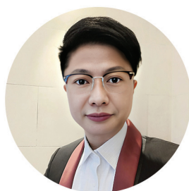
Master Albert Yeung Tak Ngai Jewellery Co, Hong Kong